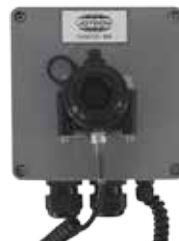
Microphone station 1808 dual system