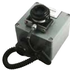
Microphone station 1176 single system