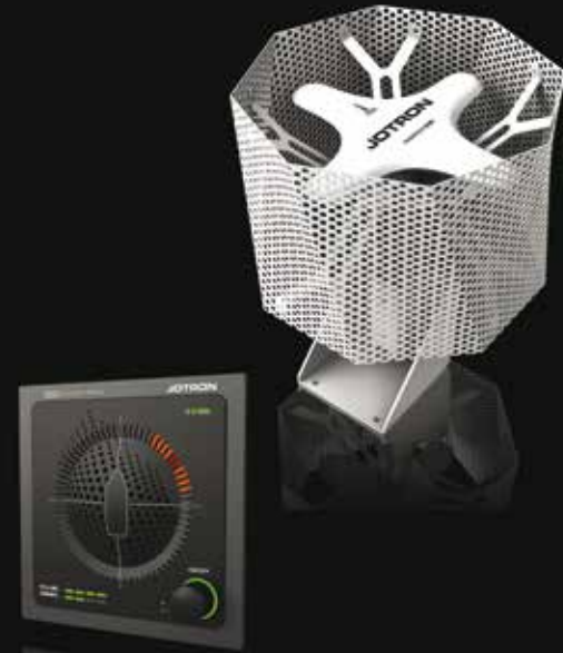
Phontech 8300 MkII and 8301 MkII

Phontech 8300 MkII is type approved by the MED, CCS, ABS, DNV and RMRS classification societies.